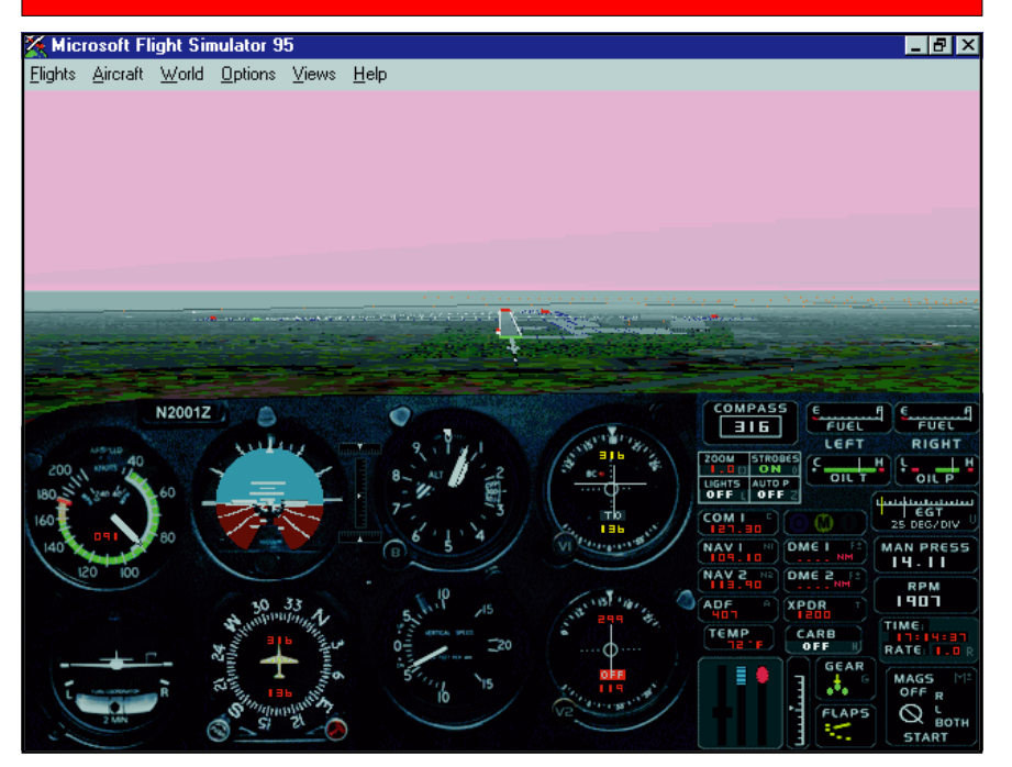
Breaking out of cloud and seeing the runway lights streaming right in front of you gives you a great feeling of satisfaction. You're clear to land.

Weather Cloud Base: 1100 Cloud Tops: 4000 Visibility: 1.5 miles Wind: Nil